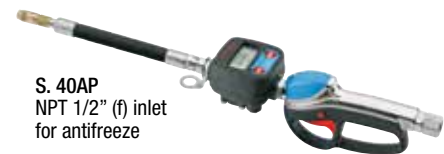
S. 40AP NPT 1/2" (f) inlet for antifreeze