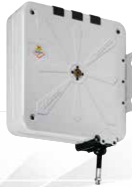
Enclosed hose reels in painted steel series 450