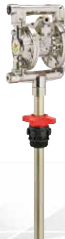
3/4" - 18.5 gpm in aluminum with suction tube