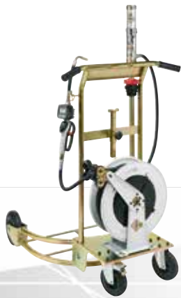
Dolly with pump, hose reel and handle with electronic meter