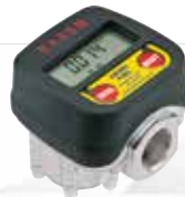
NPT 3/4" (f) inlet/outlet