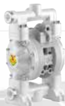
1/2" - 15.8 gpm in polypropylene