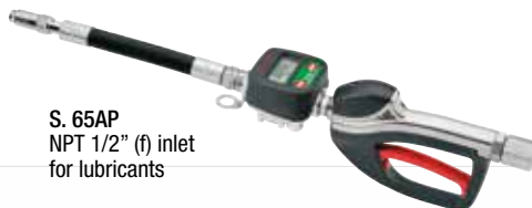
S. 65AP NPT 1/2" (f) inlet for lubricants