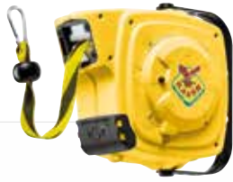
Lizard - Safety warning tape reels