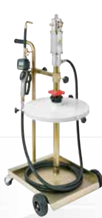
Dolly with pump and handle with electronic meter