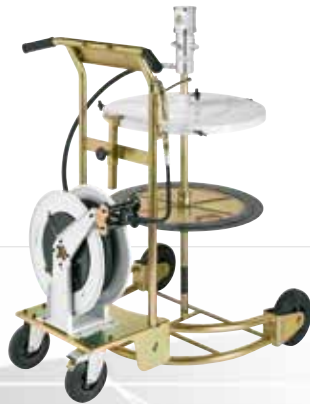
Suitable for 400 lb drum