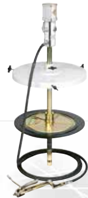
Suitable for 120 lb drum