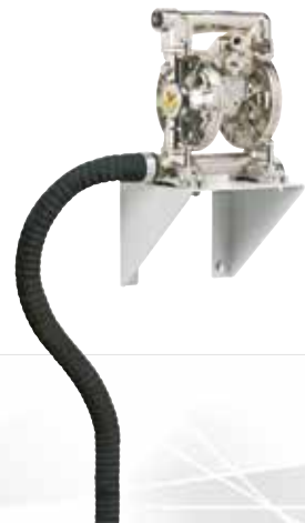
3/4" - 18.5 gpm in aluminum with suction tube and hose connection