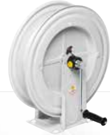
Manual hose reels in painted and stainless steel