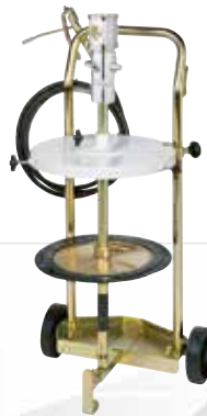
Suitable for 120 lb drum