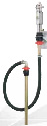
Modular wall-mounted kit