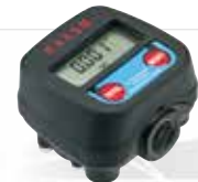
NPT 1/2" (f) inlet/outlet