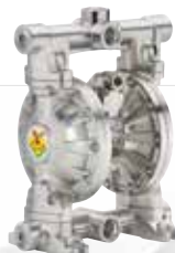
1" - 45 gpm in aluminum