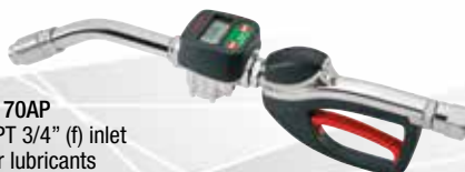
S. 70AP NPT 3/4" (f) inlet for lubricants