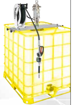
Kit for dispensing from tank with pump, hose reel and handle with electronic meter