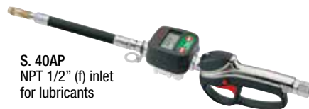
S. 40AP NPT 1/2" (f) inlet for lubricants