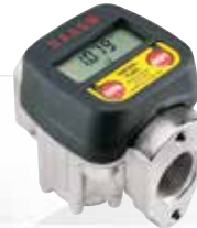
NPT 1" (f) inlet/outlet