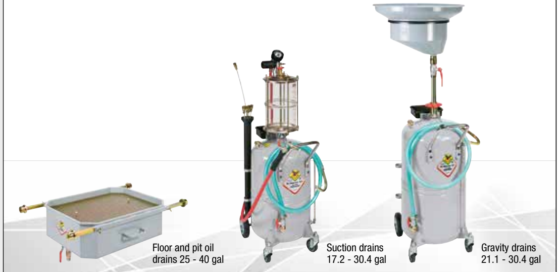
Floor and pit oil drains 25 - 40 gal