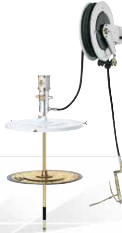
Suitable for 400 lb drum