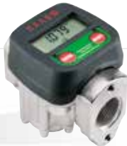
NPT 1" (f) inlet/outlet