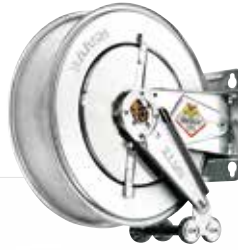
AISI 304 stainless steel hose reels