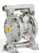
3/4" - 18.5 gpm in aluminum