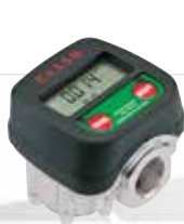
NPT 3/4" (f) inlet/outlet