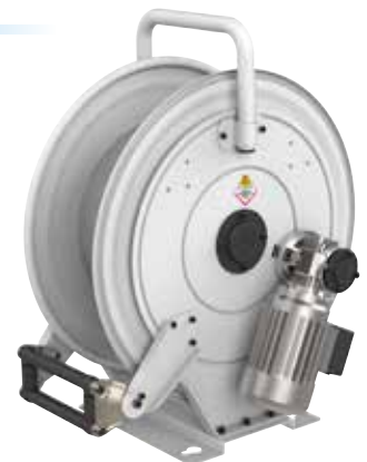
MOTORIZED HOSE REELS Series 530 - 540 - 560