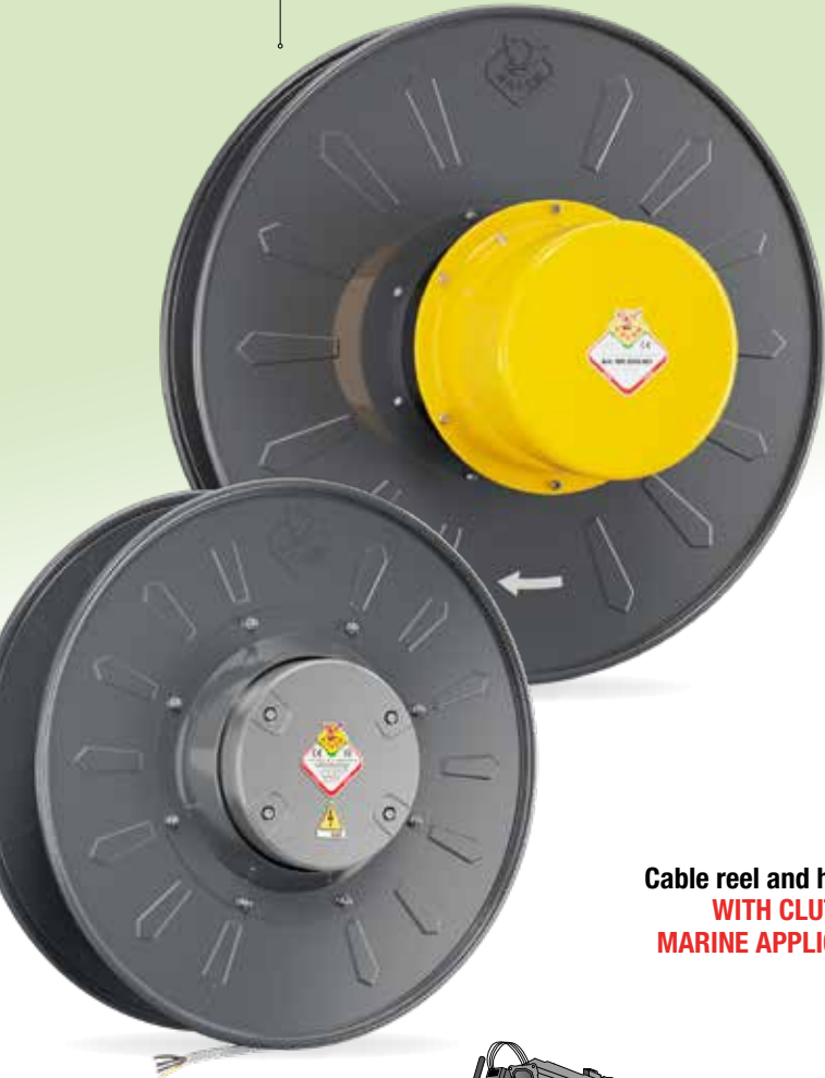
AUTOMATIC SPRING DRIVEN Cable reels