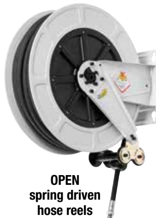
OPEN spring driven hose reels