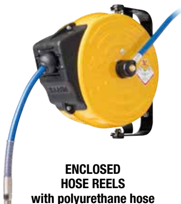
ENCLOSED HOSE REELS with polyurethane hose