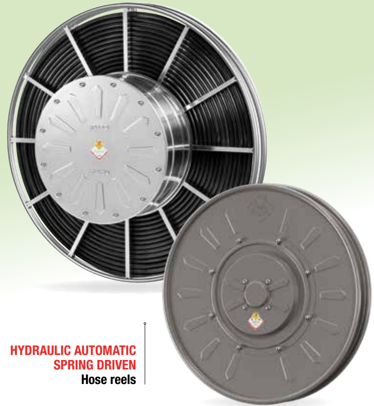
HYDRAULIC AUTOMATIC SPRING DRIVEN Hose reels